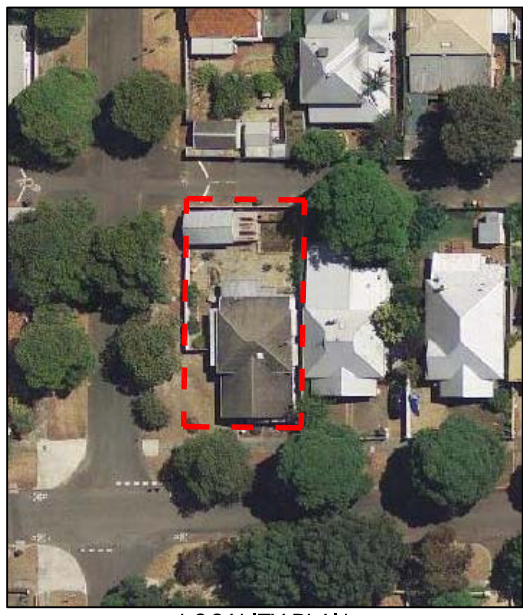
LOCALITY PLAN APPROXIMATE EXTENT OF SUBJECT SITE 2010 AERIAL PHOTOGRAPHY NOT TO SCALE